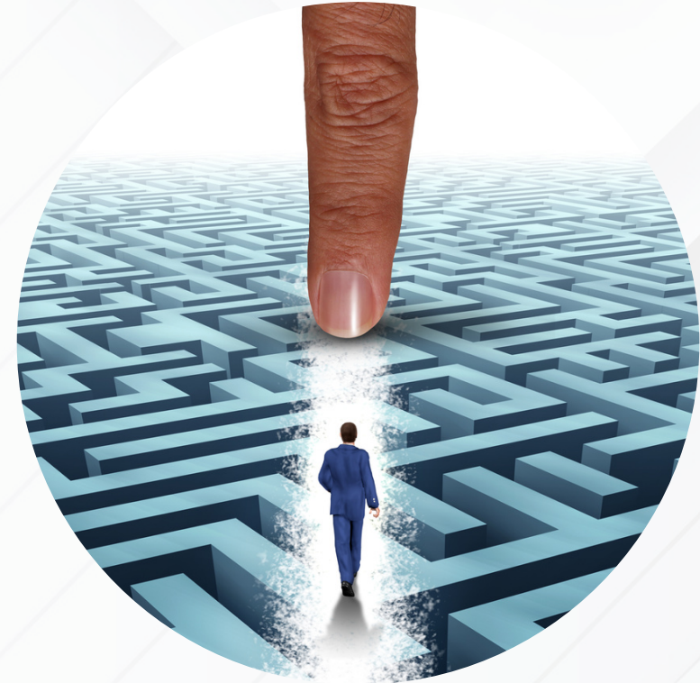
Guidance & Support