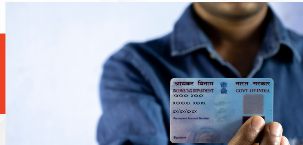
Government-issued photo identities (Aadhar Card, PAN Card, Voter ID, etc)