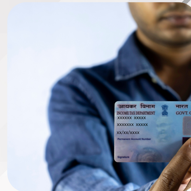
COMPANY PAN CARD