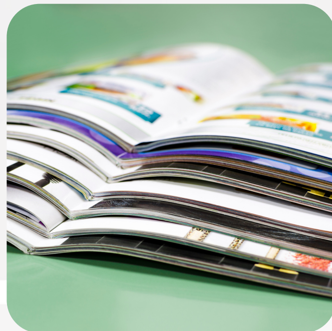
PRODUCT PHOTOGRAPHS, BROCHURE, PITCH DECK, OR DETAILS