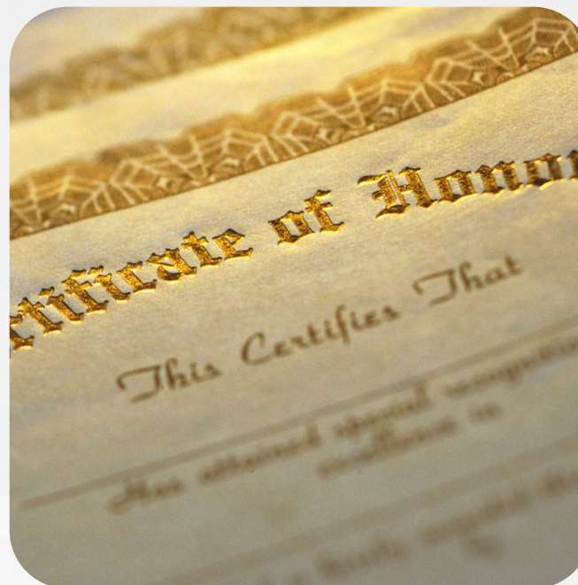
CERTIFICATE OF INCORPORATION/ LLP CERTIFICATE/ REGISTRAR OF FIRMS