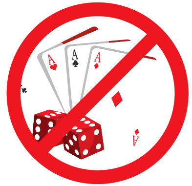
Betting/ gambling businesses