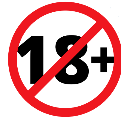
Adult products/ services