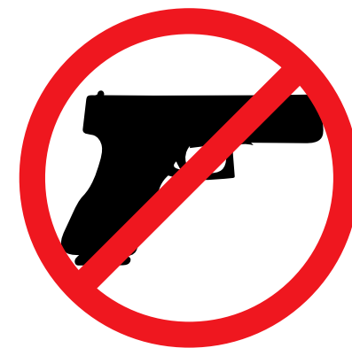
Weapons & ammunition business