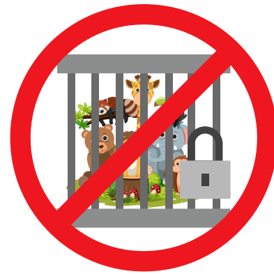
Live animals trading